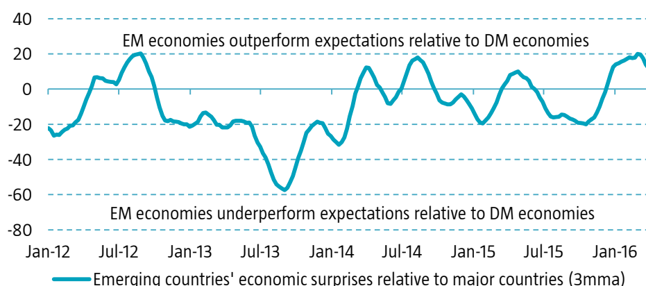
Emerging countries' economic surprise relative to core countries

The ability of some important emerging countries to engineer an improvement in aggregate demand via domestic policy action remains constrained. Both fiscal and monetary policy are constrained by rising inflation and deteriorating current accounts in several Latin countries. However, there are also countries which continue to benefit from continuing supply side reforms, which will grant them more domestic policy making flexibility to address the global growth slowdown. The chart below compares the extent to which recent economic data has surprised above market expectations in emerging versus core countries. Over the past two quarters positive surprises from emerging countries have exceeded those in core countries.